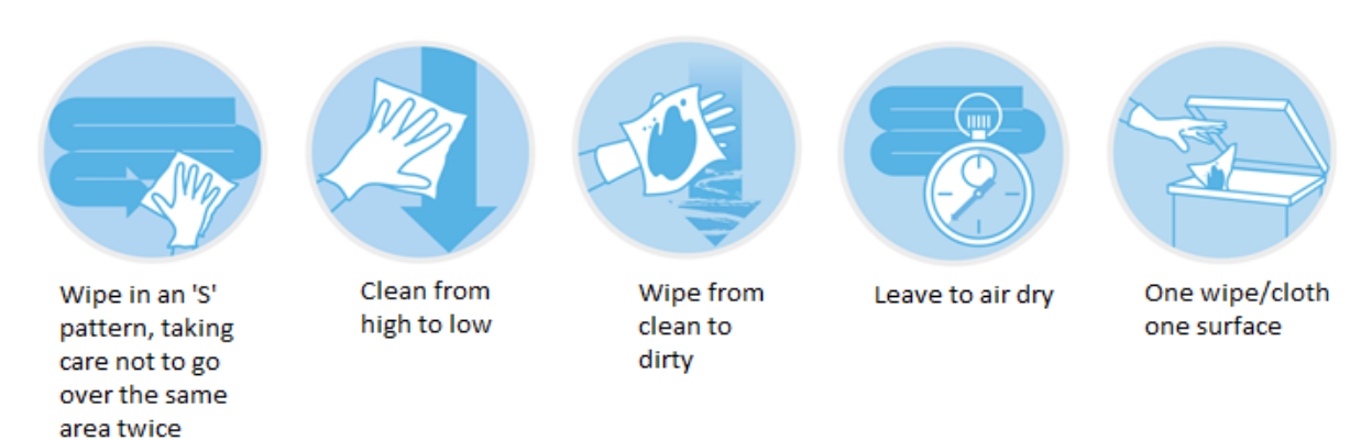
Figure 1Tips for cleaning

Cleaning is to be completed in a methodical way to prevent cross contamination of surfaces. When cleaning, it is important to clean from high to low, from clean to dirty and wipe in an 'S' shape pattern. Use of a damp dusting technique prevents dust particle dispersion when dusting surfaces (Figure 1).