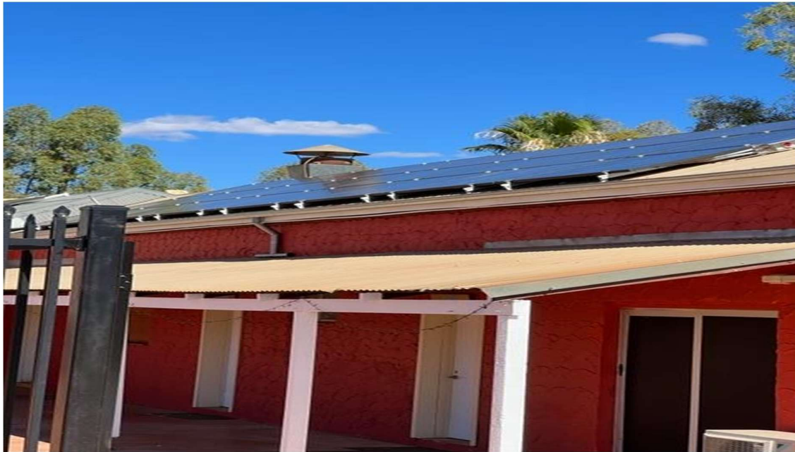
Solar panels located on Old Coach house