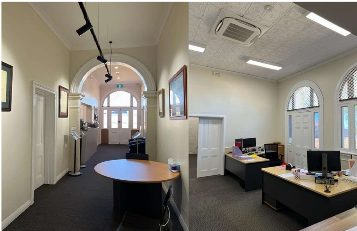
Interior of Coach house incorporating the library and offices