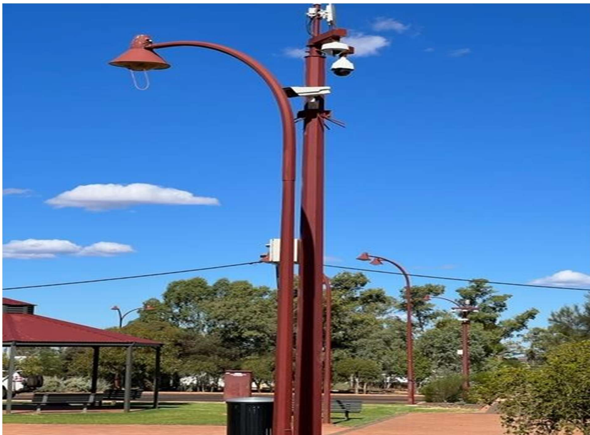
Location - Augusta Street Laverton