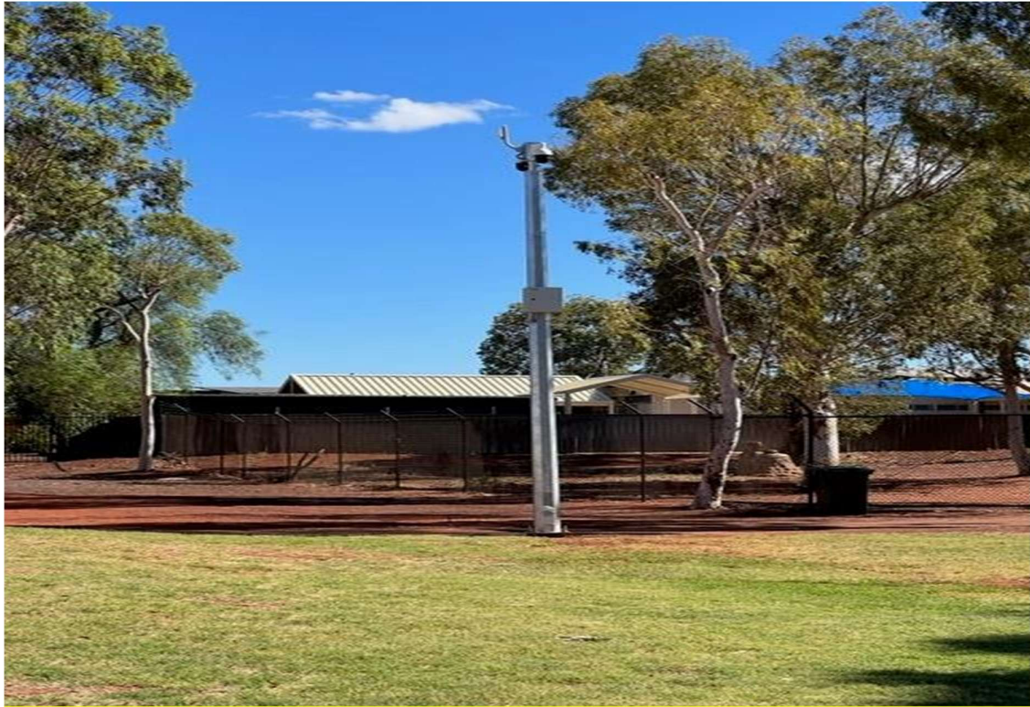
Location – to cover Old Coach house, Swimming Pool, and Town hall