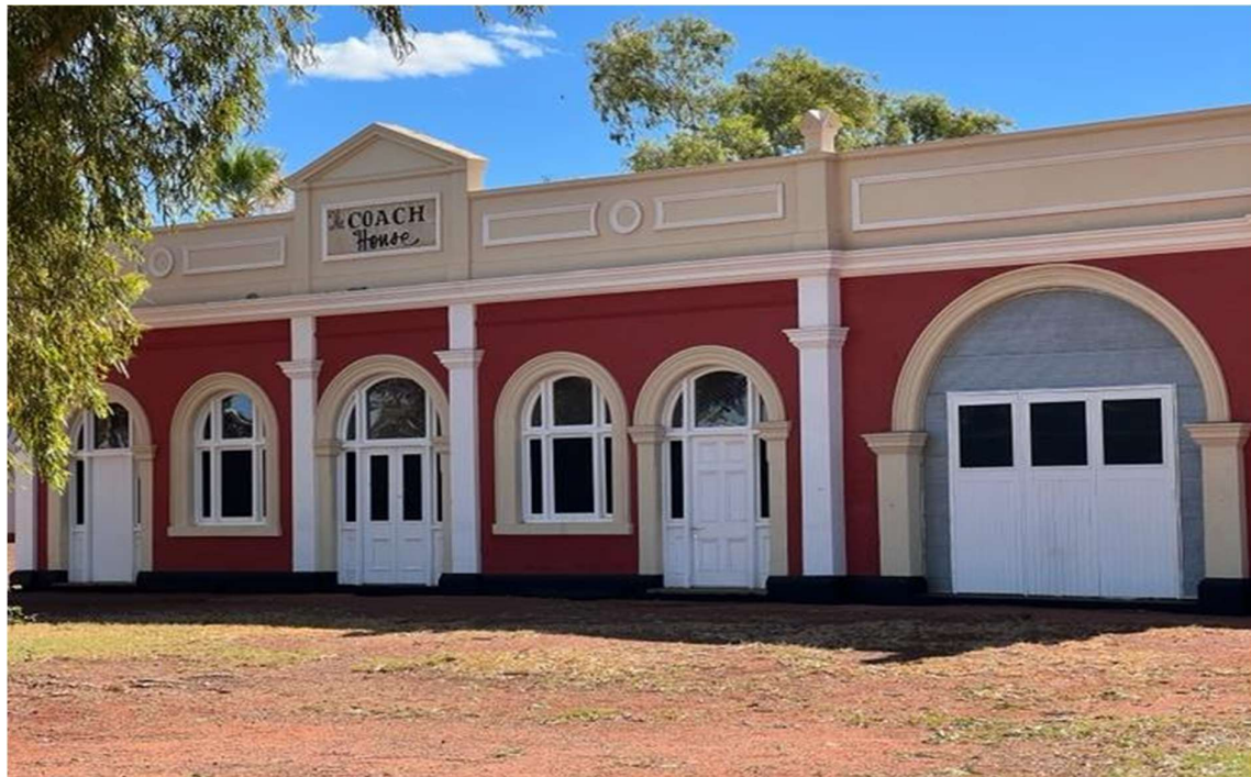
Front view of Coach House